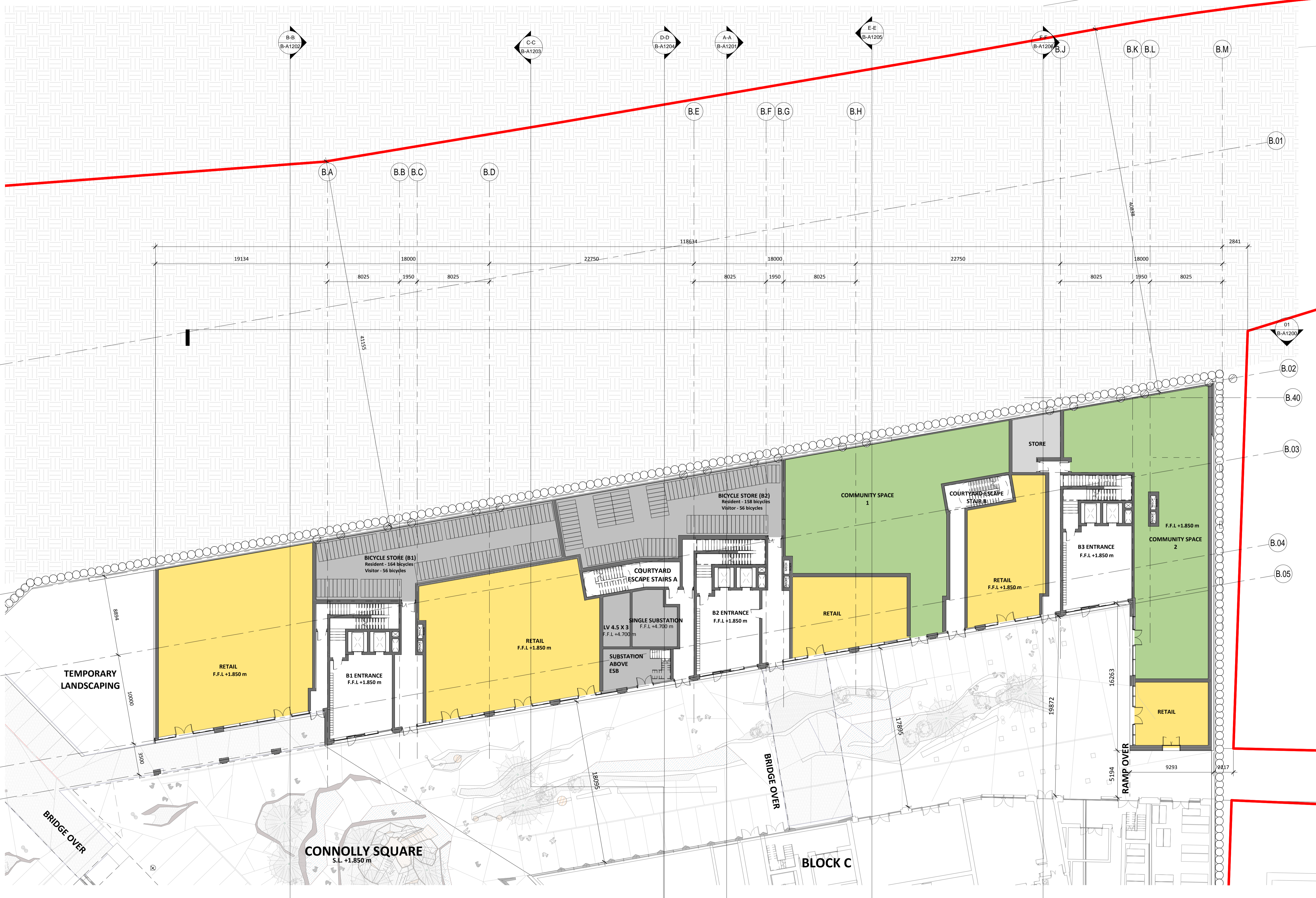
1 BLOCK B PLAN_LEVEL 00 1 : 200